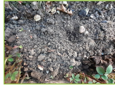
Organic matter added to soil