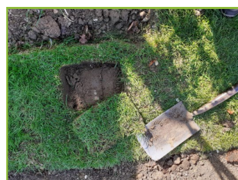
Removing turf to raise soil level

Remedy — Break up and loosen the soil before firming it down, and apply topsoil or topdressing to level up slumped areas. To raise topsoil levels in planting beds, simply add more topsoil and well-rotted organic matter between the plants, as required.