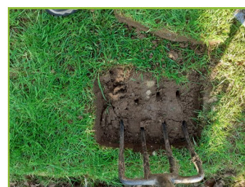
De-compacting soil under turf

Natural settlement. It is common for soil to experience a degree of settlement after it has been placed and cultivated.