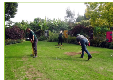
Top dressing a lawn after aeration