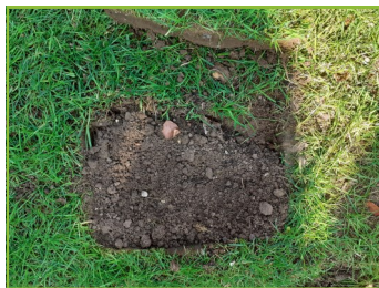
Raising soil level beneath turf with topsoil or topdressing