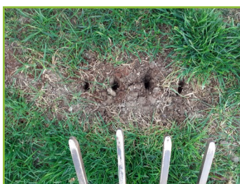
Manually aerating the soil with a garden fork