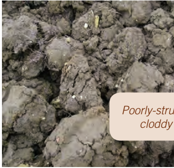
Poorly-structured, cloddy soil