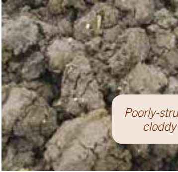
Poorly-structured, cloddy soil