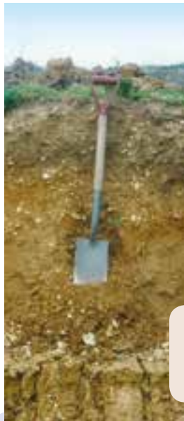
Typical soil profile