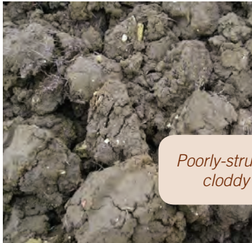
Poorly-structured, cloddy soil