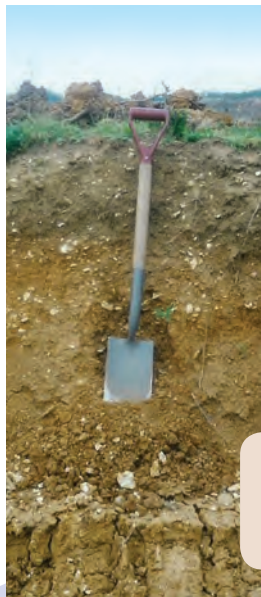
Typical soil profile

Usually lighter in colour as it does not contain as much organic matter as topsoil. This layer can be composed of varying proportions of clay, sand, silt and stones.