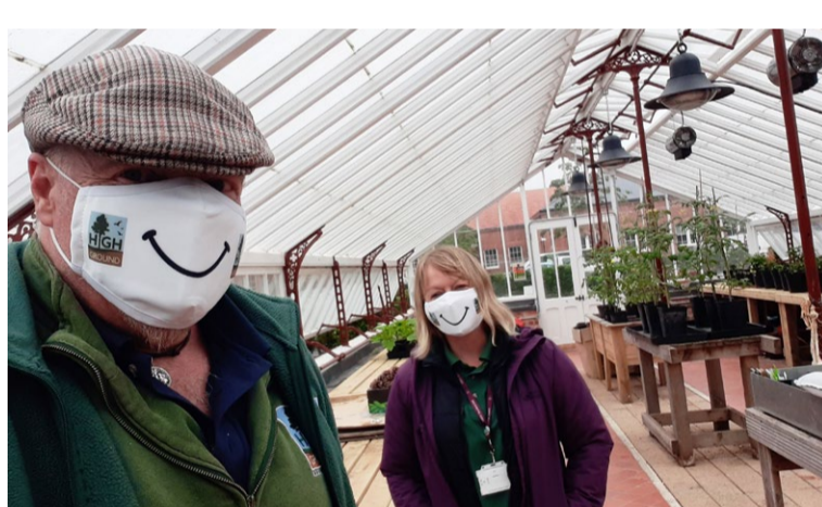
First day back in the greenhouse post lockdown.