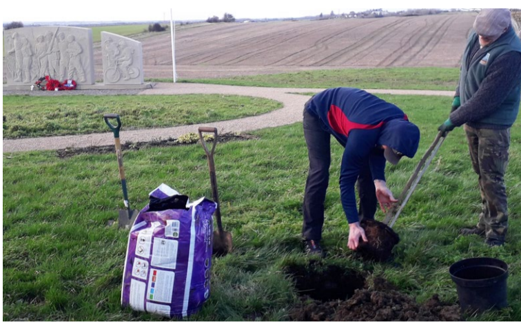
Tree planting at the Friends of the Tenth memorial.