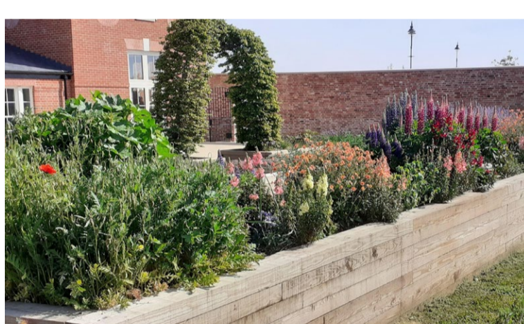
Pears Walled Garden perennial bed in bloom.