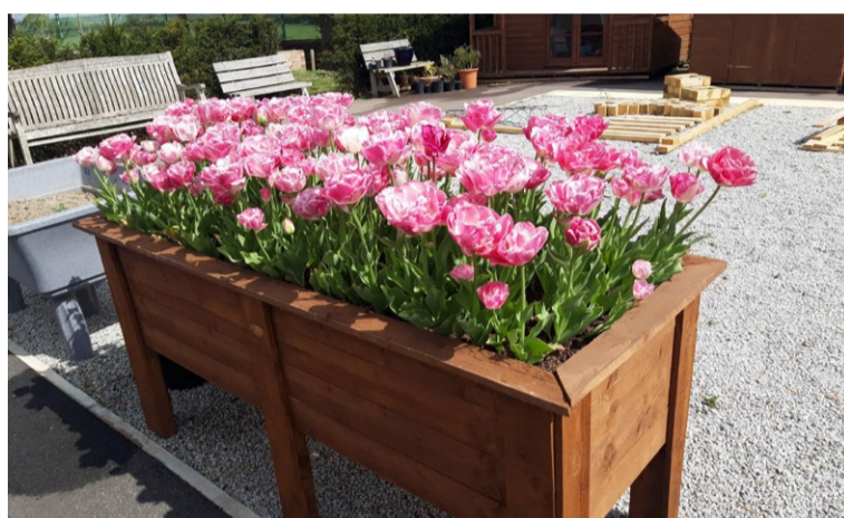
Tulips in bloom.