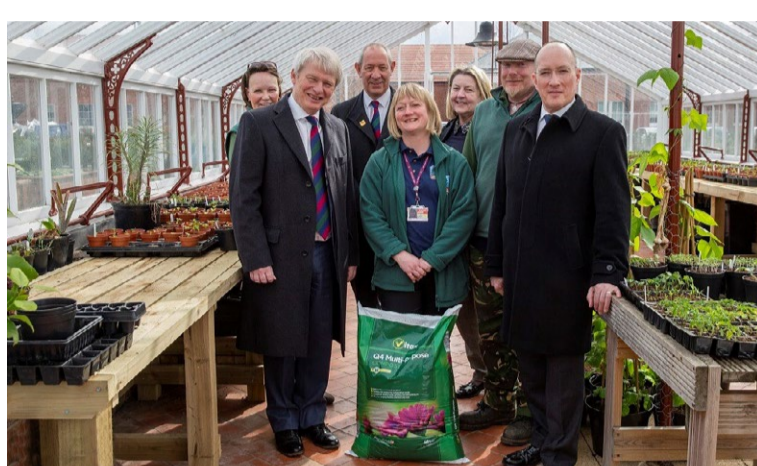
Vitax and ABF visit.