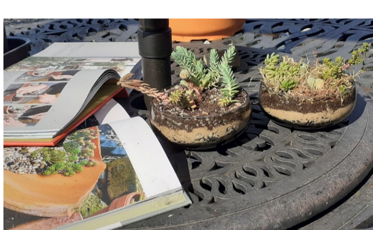
Planting open terrariums.