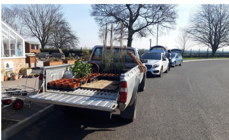
Emptying the greenhouse before #Lockdown1.