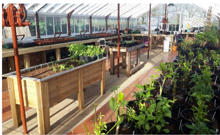
Greenhouse full of plants.