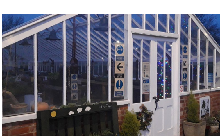
The greenhouse at Christmas.

HighGround adheres to the latest Government and Unit policy in preventing the spread of CV-19.