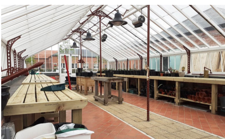
Empty greenhouse during lockdown.