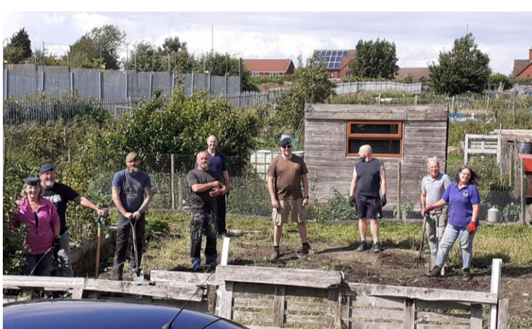
Veterans' Breakfast Club allotment – socially distanced.