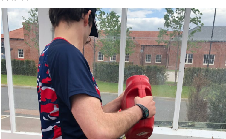
Patient watering plants in the greenhouse.