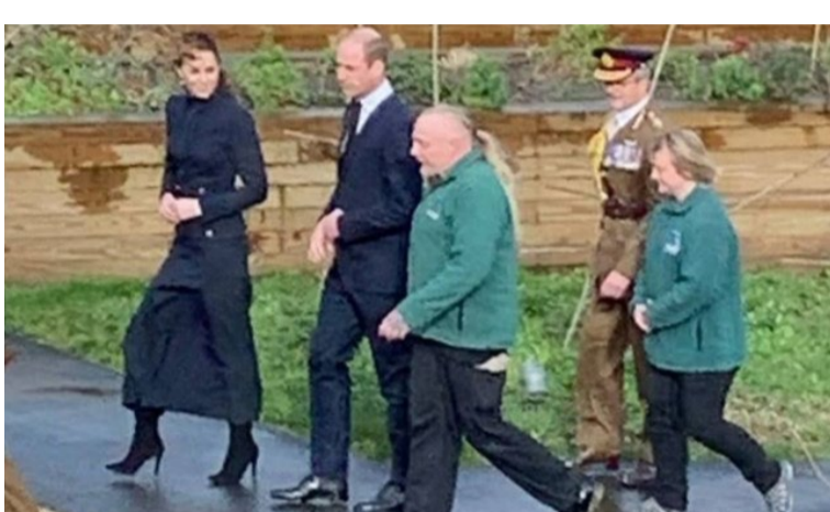
Royal visit to DMRC. Their Royal Highnesses in the Pears Walled Garden.