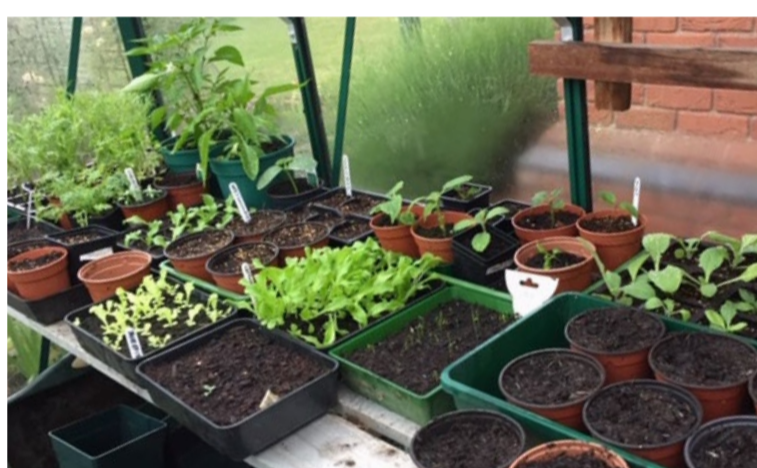
Gardening Volunteer Sasha's seedlings.