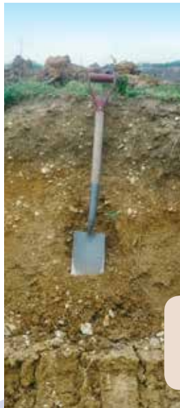
Typical soil profile