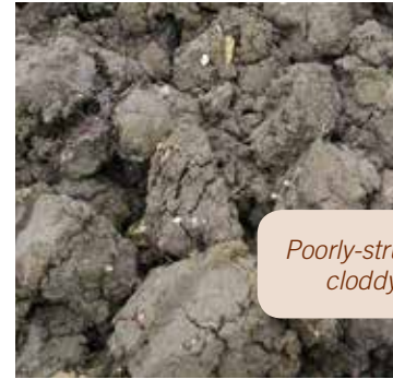
Poorly-structured, cloddy soil