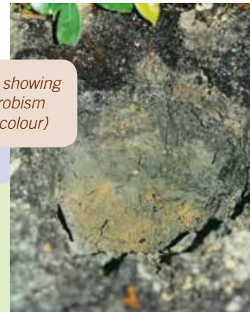
Trial pit showing anaerobism (grey colour)

Without structure, soils will suffer from anaerobism, waterlogging and nutrient lock-up and, ultimately, plants will die!